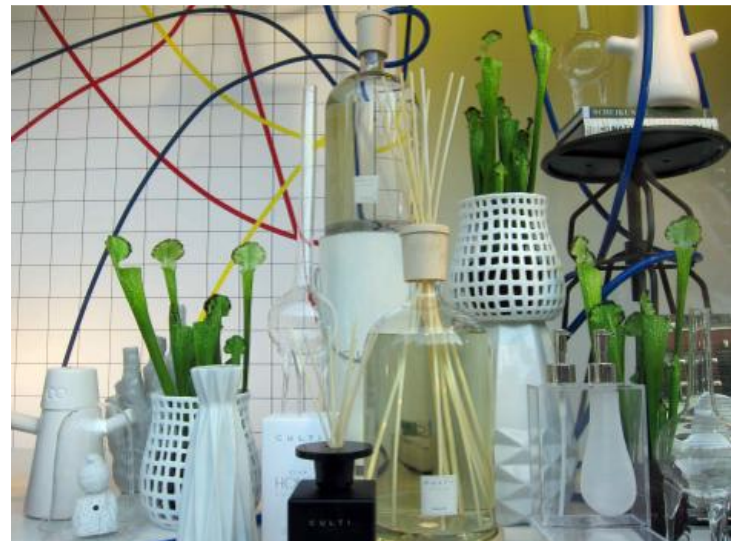
de Bijenkorf, Amsterdam