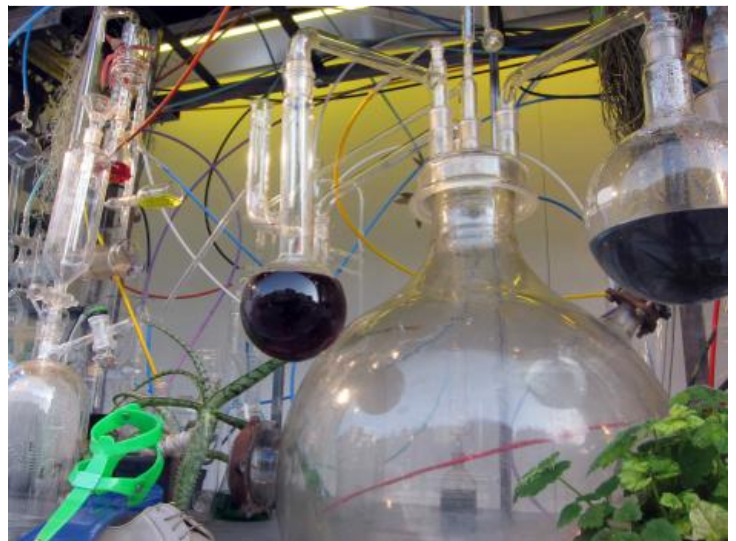
de Bijenkorf, Amsterdam