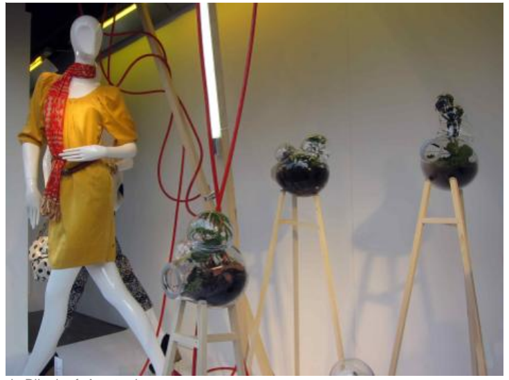
de Bijenkorf, Amsterdam