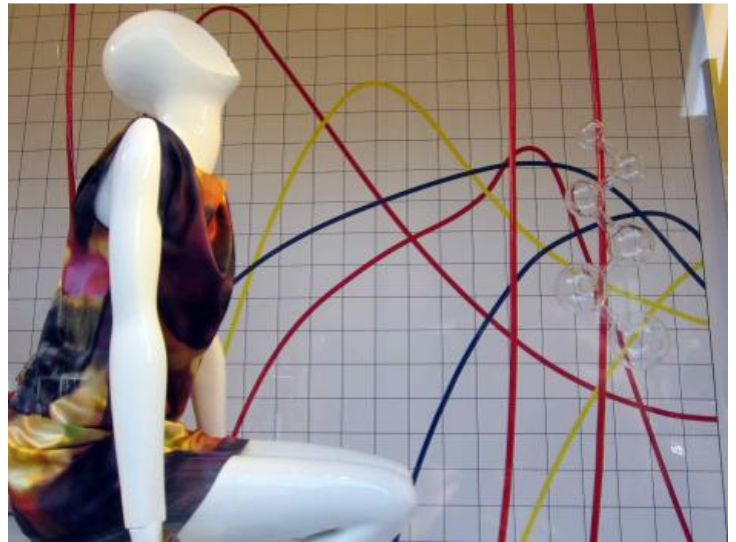
de Bijenkorf, Amsterdam