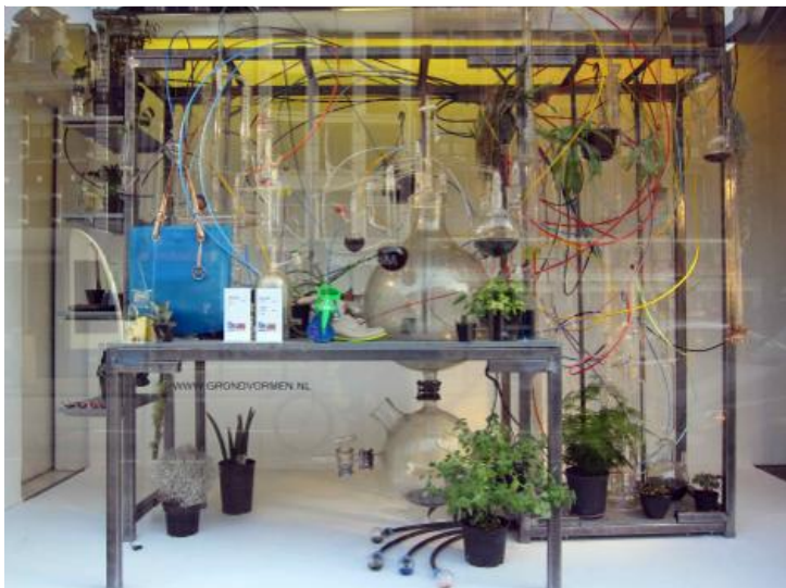
de Bijenkorf, Amsterdam