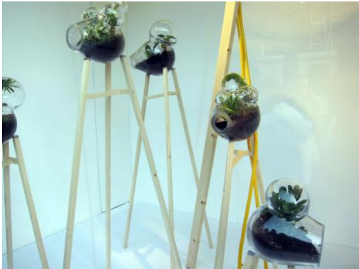
de Bijenkorf, Amsterdam