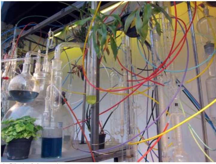
de Bijenkorf, Amsterdam