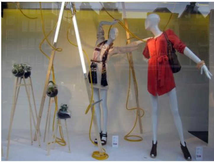
de Bijenkorf, Amsterdam