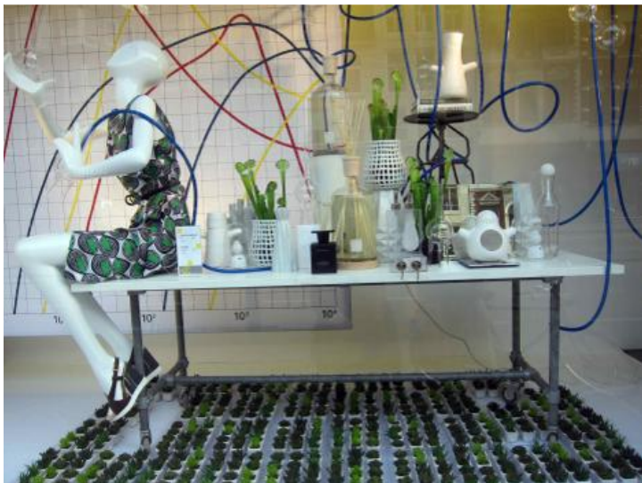
de Bijenkorf, Amsterdam