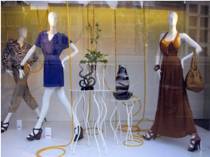
de Bijenkorf, Amsterdam