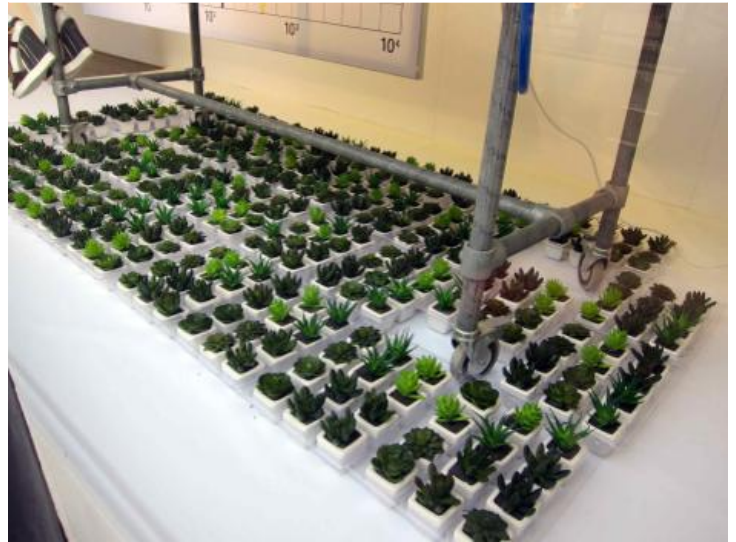
de Bijenkorf, Amsterdam