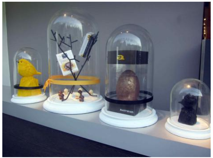
de Bijenkorf, Amsterdam