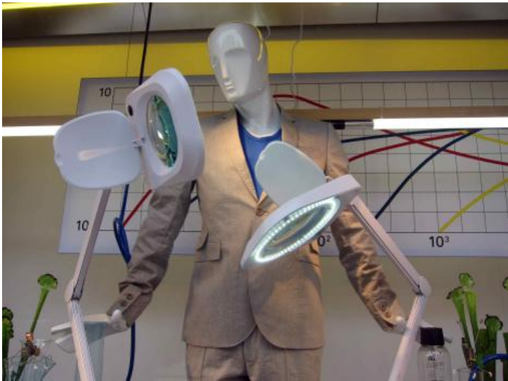
de Bijenkorf, Amsterdam