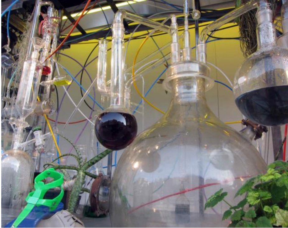
de Bijenkorf, Amsterdam

Design group Grondvormen used hand-blown glass bottles filled with earth, plants, and water for the worlds-within-worlds laboratory windows.