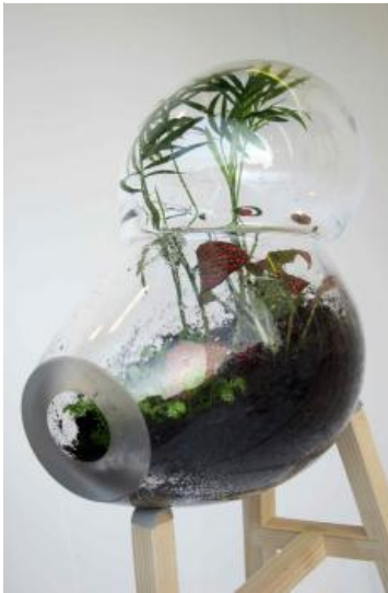
de Bijenkorf, Amsterdam